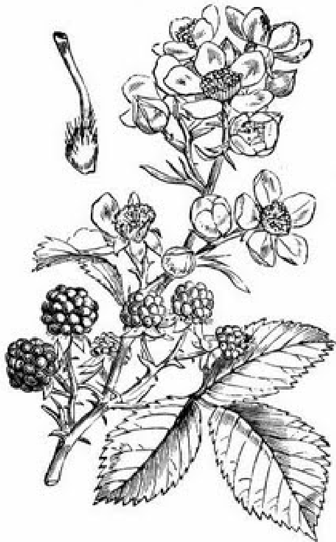
308. Rubus fruticosus L.